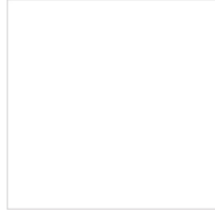
White - WHI